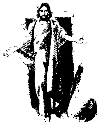
He has Risen

Non-Profit Org. U.S. Postage Paid Newark, N.J. Permit No. 7007